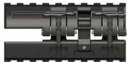
7.125" COMPACT BAABS

L=4.875" x W=3.03" x H=3.47" Weight = .62 lbs.