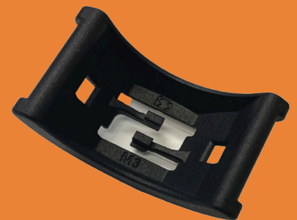
Blast Hose Gripper

Can be configured for left or right-handed blasting