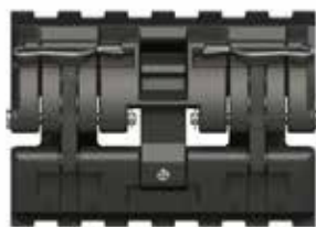
4.875" SUBCOMPACT BAABS

L=4.875" x W=3.03" x H=3.47" Weight = .62 lbs.