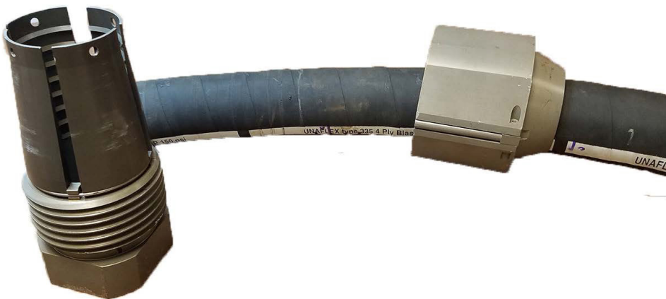
QUIKCLAW FITTING DISASSEMBLED