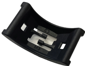
Blast Hose Gripper