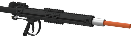
BAABS 2XL Rail Assembly w/ Electric G3 Trigger Deadman & Adjustable Brace

BAABS 2XL has the same benefits as the original, providing 30" additional reach or extension beyond a conventional setup. This allows operators to stay on the ground to blast overhead and not require scaffolding or some other work platform. This saves money in setup/takedown material and labor and presents a safer blasting operation, as the operator doesn't need to navigate these elevated positions.