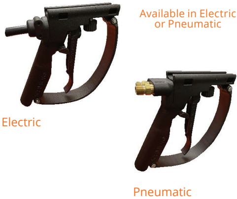
Adjustable Brace Assembly