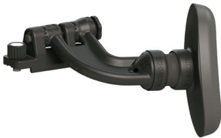
Can be configured for left or right-handed blasting